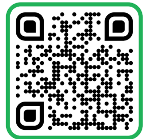
QR Code to HSA Welcome Page

We'll show you how to add your bank account information, sign up for text alerts, download our mobile app, and more!